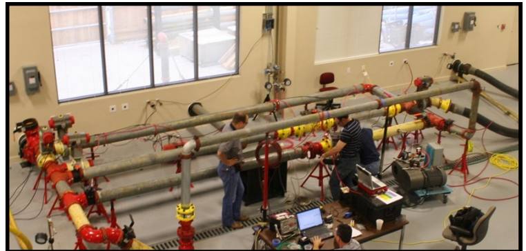
Flow loop can be rapidly reconfigured to simulate in-plant piping configurations

Operational verification through innovative mechanical and flow loop testing